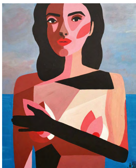
la donna | 2019 | 50x60cm