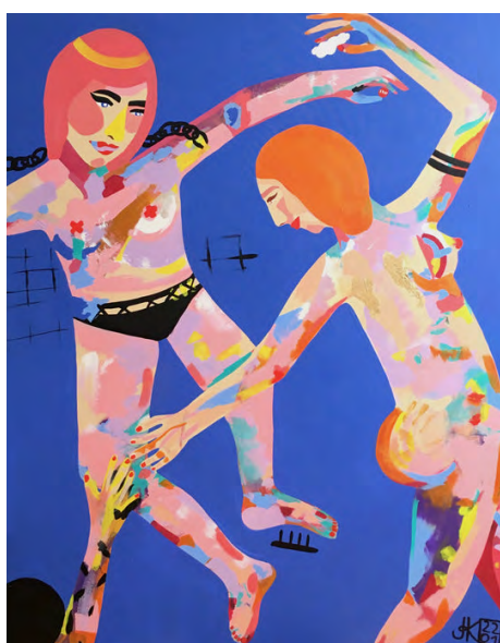
free spirit | 125x150 | 2021

Press Photos are available for download here