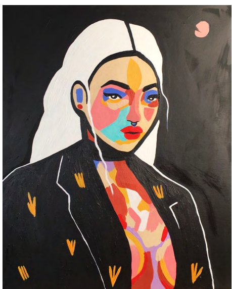
liquid nights | 2021 | 50x60cm