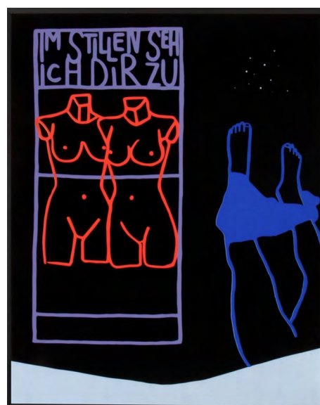
schaufenster | 50x70cm