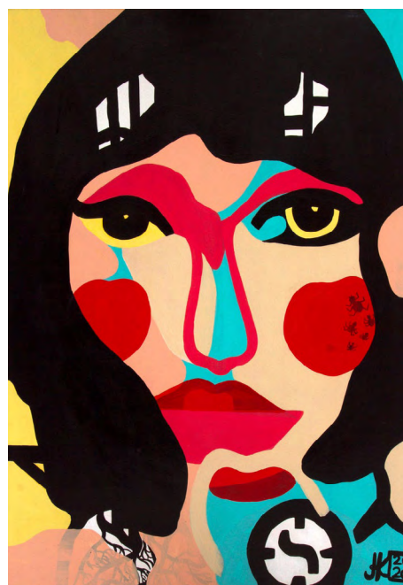
out of the dark | 2020 | 70x100cm